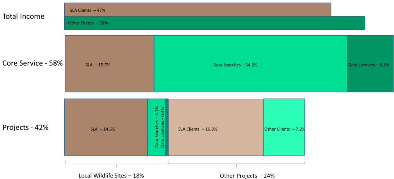
FIGURE 1: SOURCES OF TVERC’S INCOME BASED ON 22/23 FORECAST

As a non-profit organisation, TVERC’s income sustains the services we provide to the local recording community, who in turn share their data with us, so we can share it with everyone. By using TVERC as a central resource, the costs of collating and managing the databases are spread across all our funding sources, which results in economies of scale for everyone.