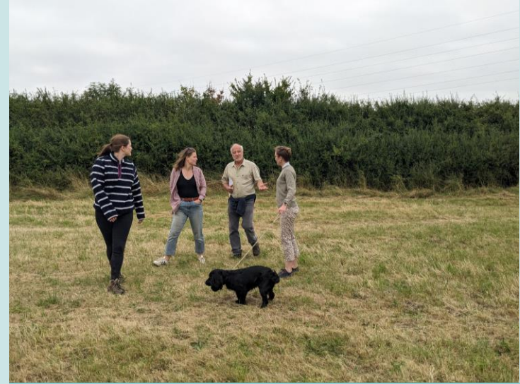
Site visit: Nuneham Courtenay Estate

500m of hedgerow rejuvenated and over 2.5km of new hedgerow planted.