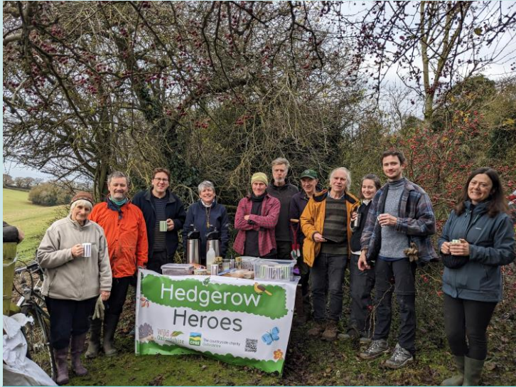
Volunteers in Ewelme