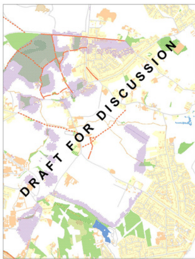
Connected habitat network

We use our database of priority habitats and public Rights of Way to identify potential green corridors